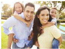
Married & Single Parents

Everyone who wants to be the best for their children!